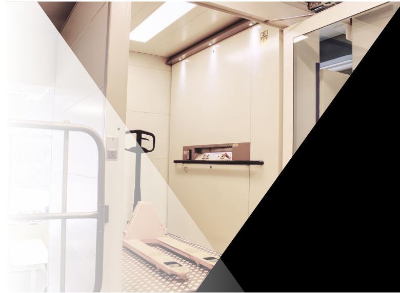
Gartec 1000: Light Goods Use